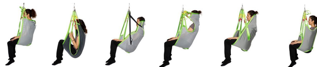
REUSABLE SLINGS (ALL-ROUND)